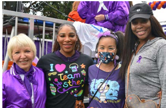
Serena & Venus Williams